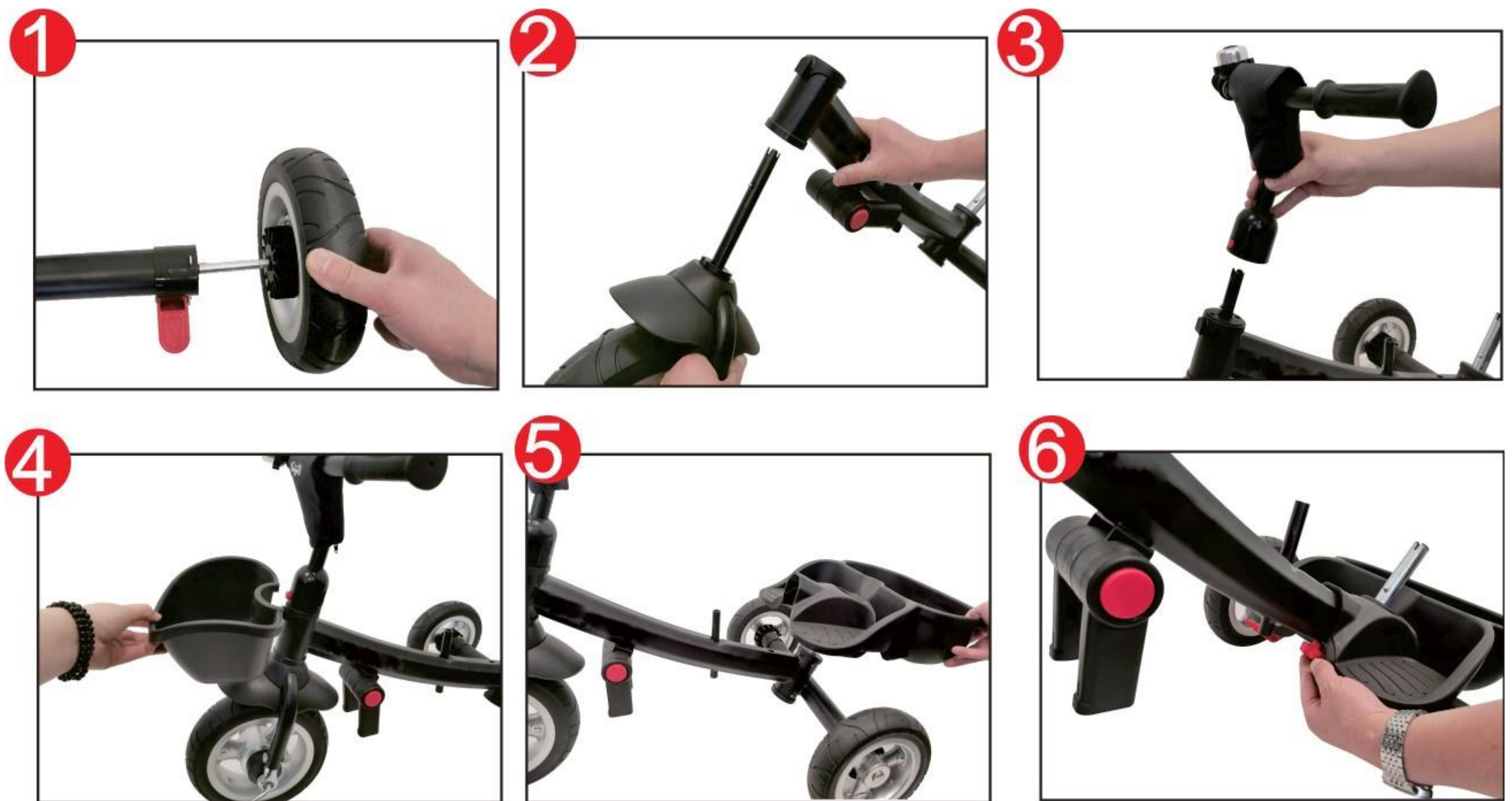
Fig.1 Assemble rear wheels (6) onto each side of the axle of rear frame (2).

If you can hear a „click“, it means they have been fixed properly. Make sure the wheels are secured properly - test your installation by pulling the wheels a few times before using.