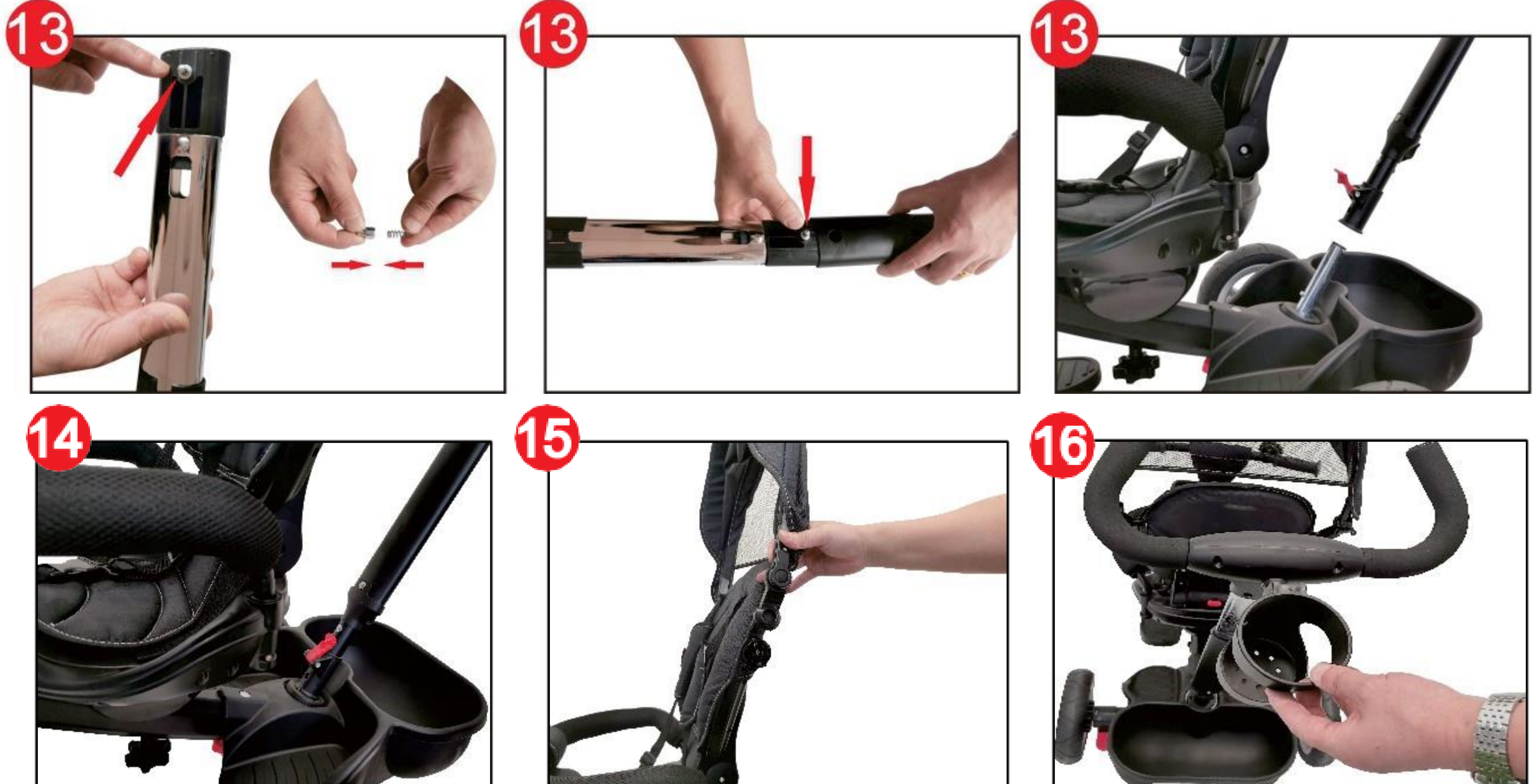
Fig.13 Connect the upper push rod with lower push rod as per operation shown.

Fig.14 Insert the assembled complete rod into the steering rod. Secure by locking the red button.