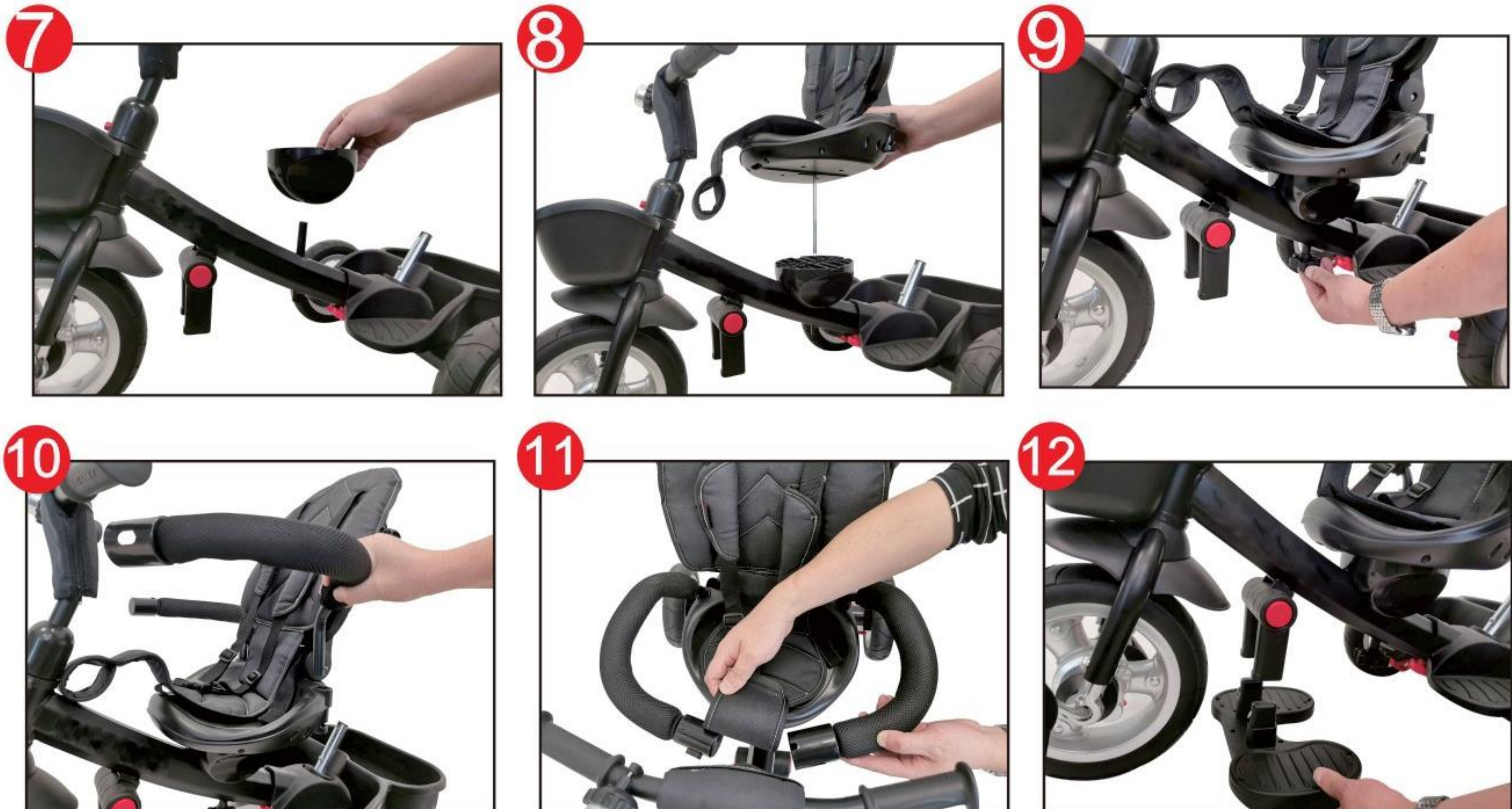
Fig.7 Place the seat base (10) on the frame, and release the fitting screw on the seat unit (3).

Fig.8-9 Join the seat unit through the base(10) and then tighten seat fitting screw.