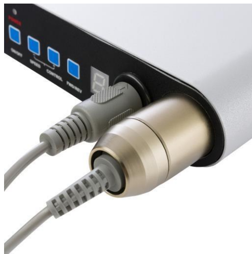
Fig 3 Handpiece