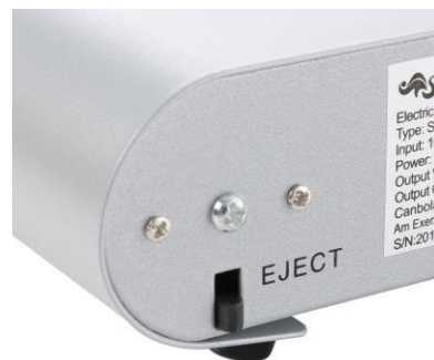
Fig 2 Eject button for the handpiece