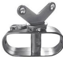
1 x cord tensioner