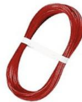
1 x tension cord