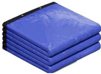
1 x Pool cover